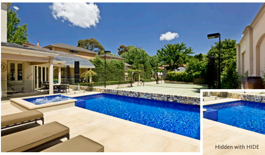
Hidden with HIDE

Beautifully landscaped courtyards and poolsapes with HIDE covers showcase thoughtful design and innovative construction techniques.